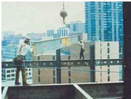
At-risk workers without appropriate safety equipment

Physical hazards are a common source of injuries in many industries. They are perhaps unavoidable in certain industries, such as construction and mining, but over time people have developed safety methods and procedures to manage the risks of physical danger in the workplace. Employment of children may pose special problems. Falls are a common cause of occupational injuries and fatalities, especially in construction, extraction, transportation, healthcare, and building cleaning and maintenance.